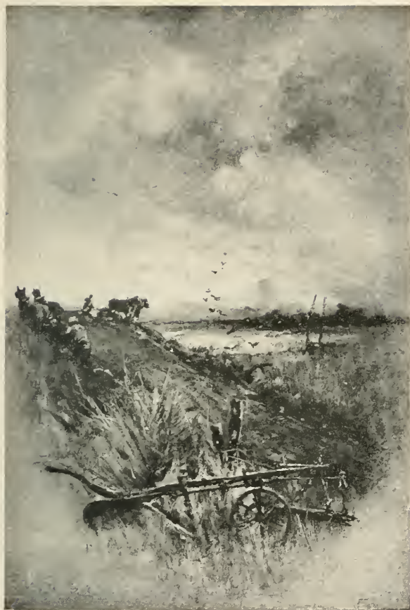
Let not Ambition mock their useful toil